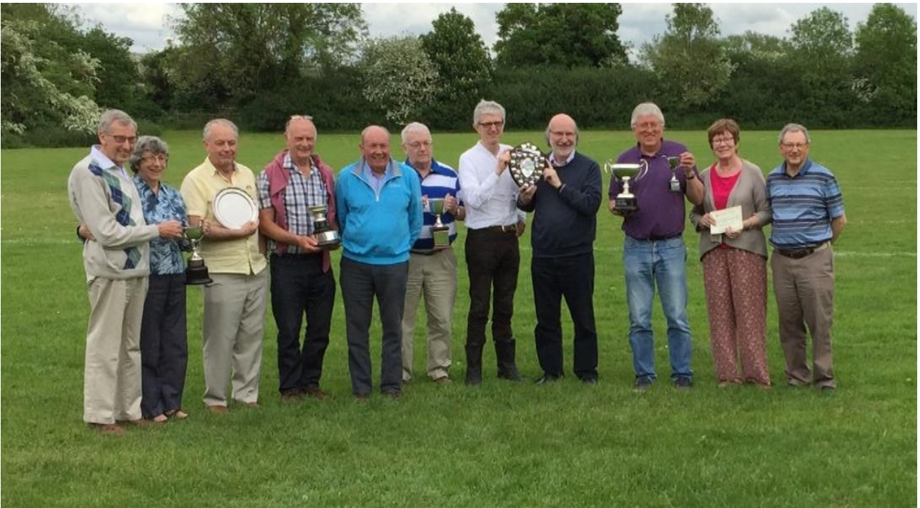
Trophy Winners at the 2016 SCBA AGM